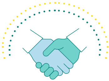
PARTNERSHIPS AND TRUST