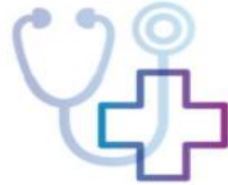
Flu Champion Toolkit for Healthcare Professionals