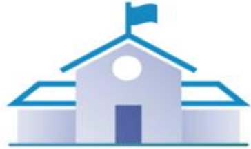
Flu Champion Toolkit for Schools & Universities