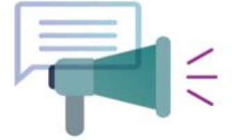
Flu Champion Toolkit for General Advocates