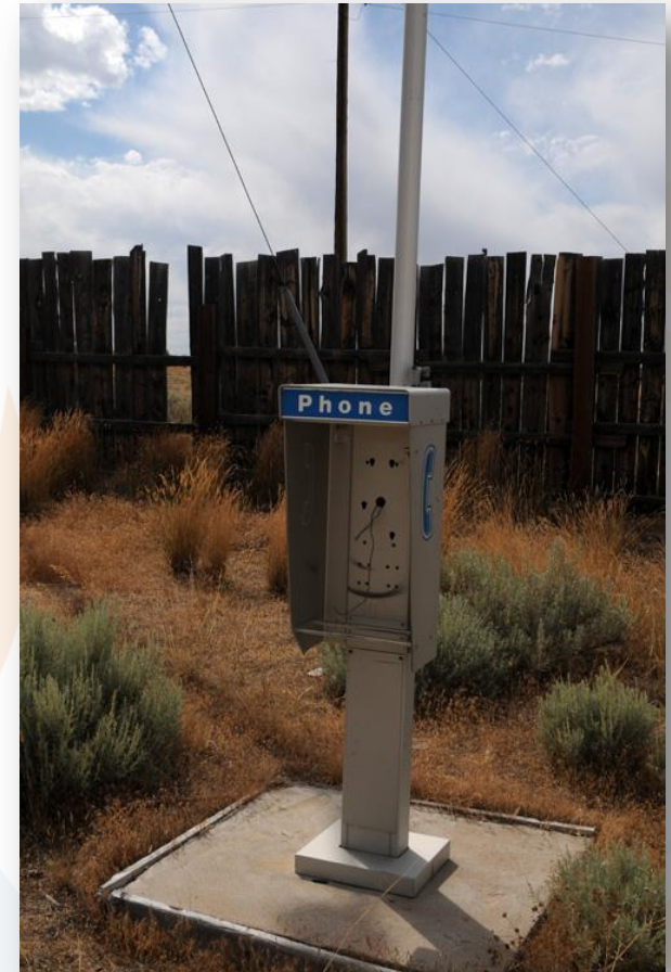
Jeffrey City, Wyoming