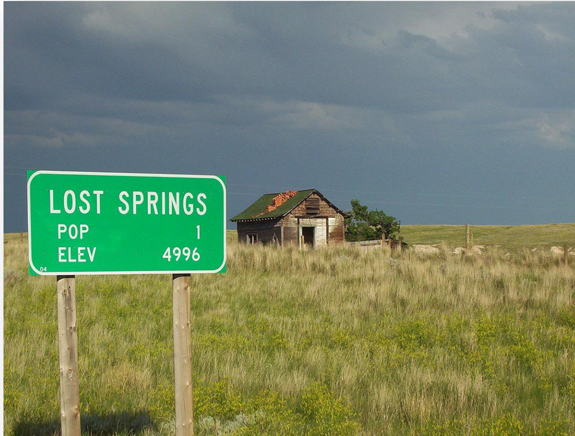
Lost Springs, Wyoming (2000 Census)